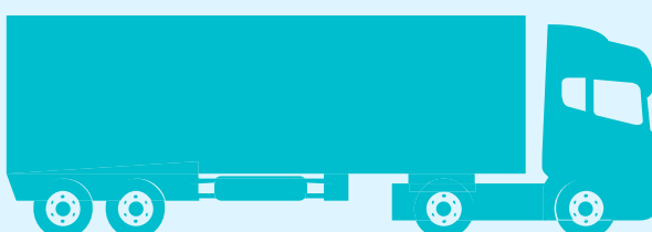
Large goods/passenger vehicles